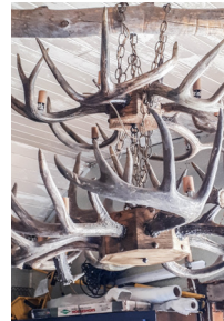
1 double-tiered WT chandelier $950.00