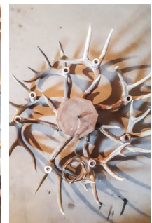
1 single-tiered WT chandelier $750.00