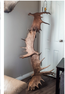
1 moose horn floor lamp $995.00