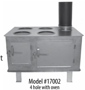
Model #17002 4 hole with oven

Text Scott at 403-638-7805 to get one before they are gone.